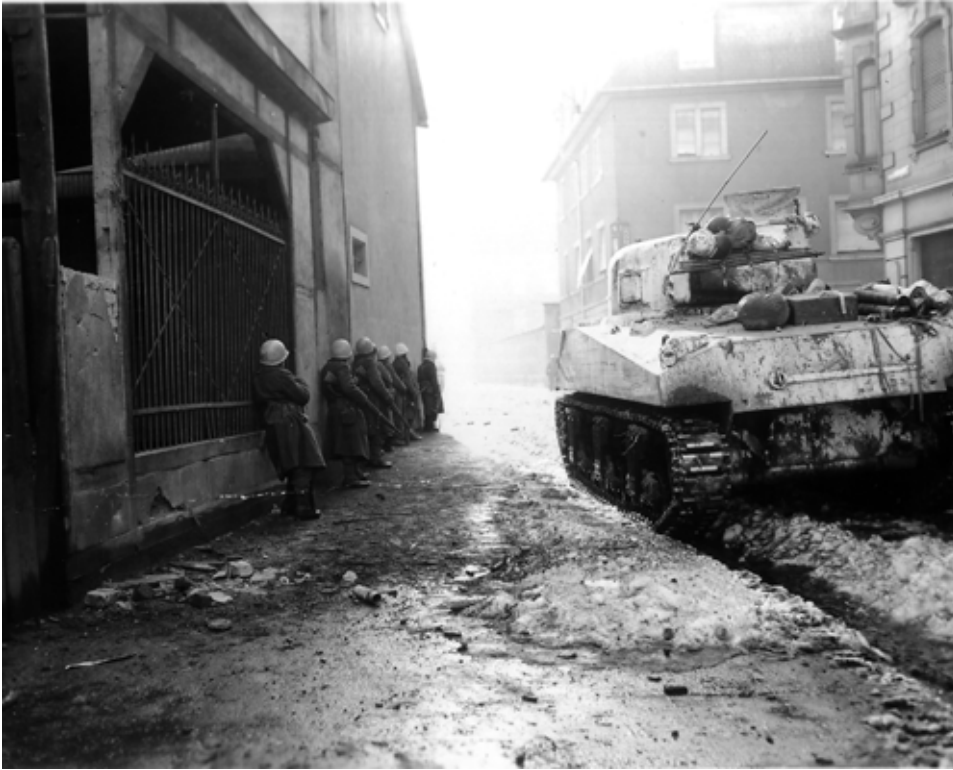
SC-199971: French tanks and infantry work their way into Colmar under sniper fire on 2 February 1945.