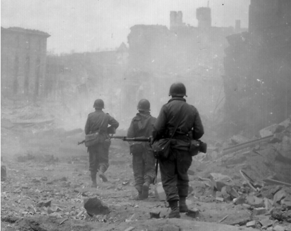
SC-202746: Riflemen from the 3d Infantry Division enter Zweibrücken as Seventh Army begins its final sweep west of the Rhine River in March 1944.