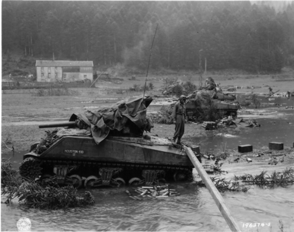
SC-196374-S: Seventh Army tanks on 8 November 1944 are almost inundated after forty-three hours of rain.