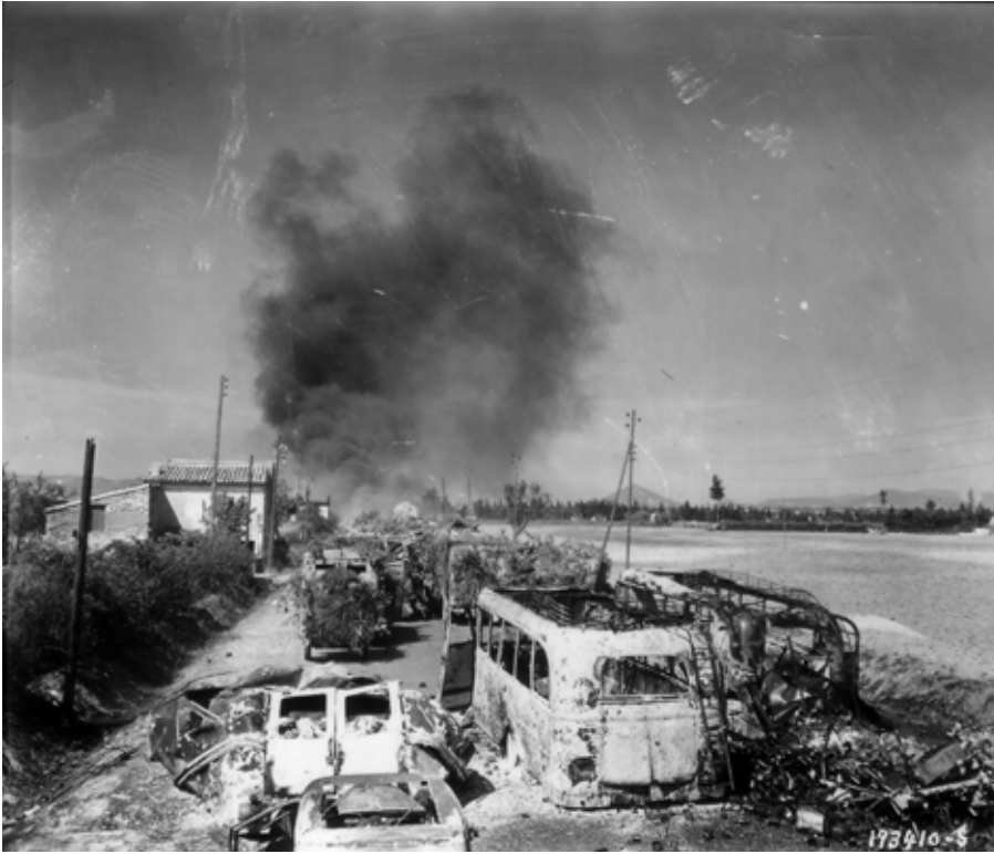
SC-193410-S: Wreckage of German vehicles clogs Highway 7 near Montélimar on 28 August 1944.