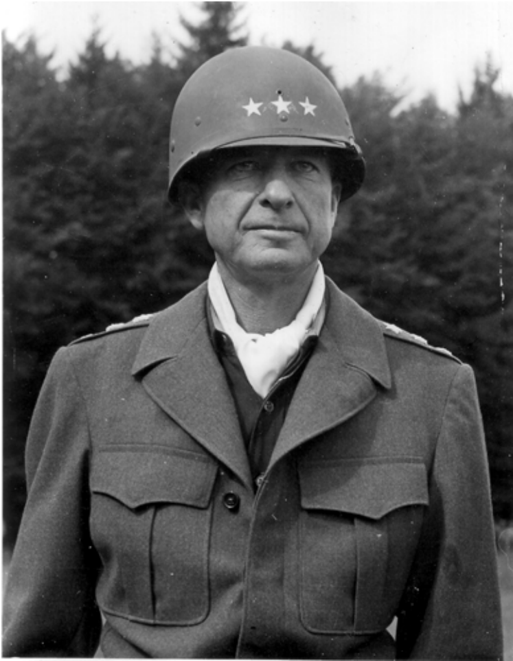
SC-196341: Lt. Gen. Alexander "Sandy" Patch commanded the Seventh Army.