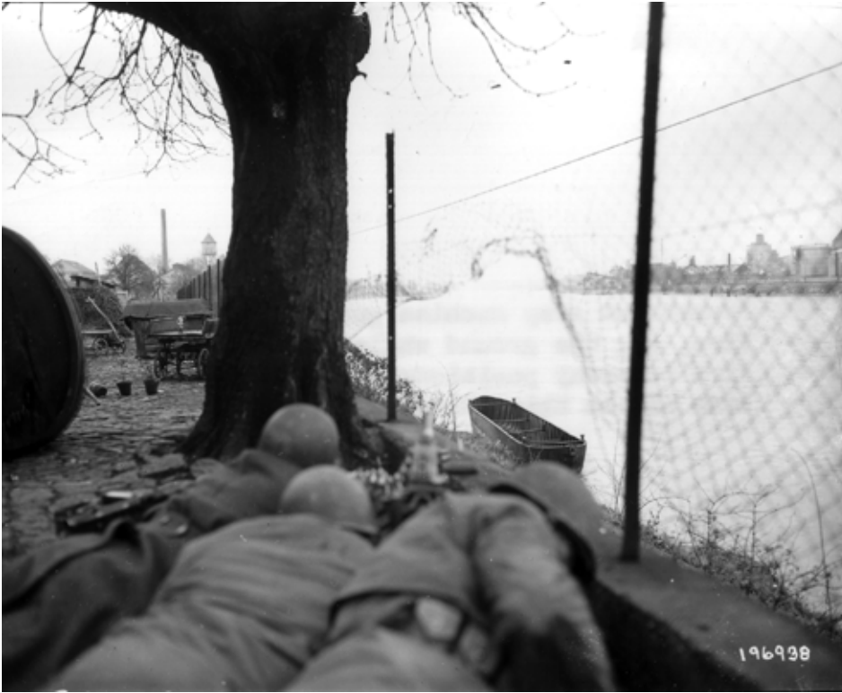
SC-196938: French troops battle Germans still holed up on the French bank of the Rhine at Huningue on 30 November 1944.