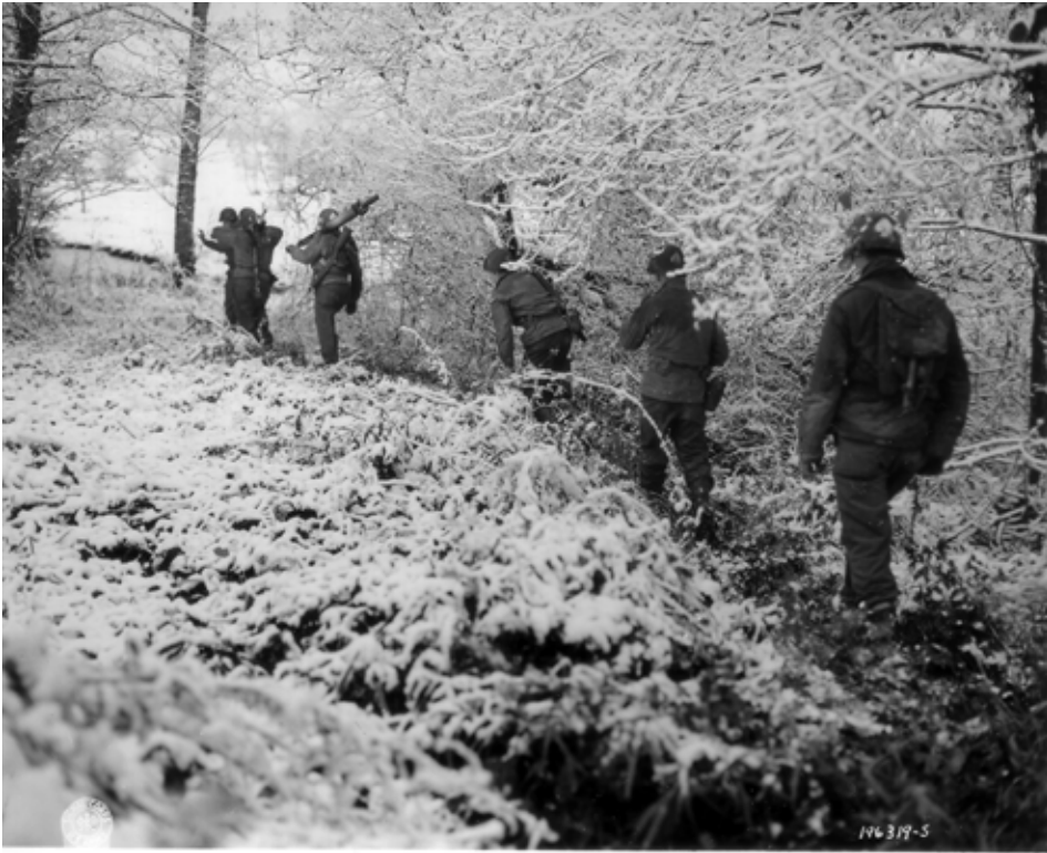
SC-196319-S: The 1st Battalion, 30th Infantry Regiment, conducts training just before Truscott's surprise in mid November 1944.