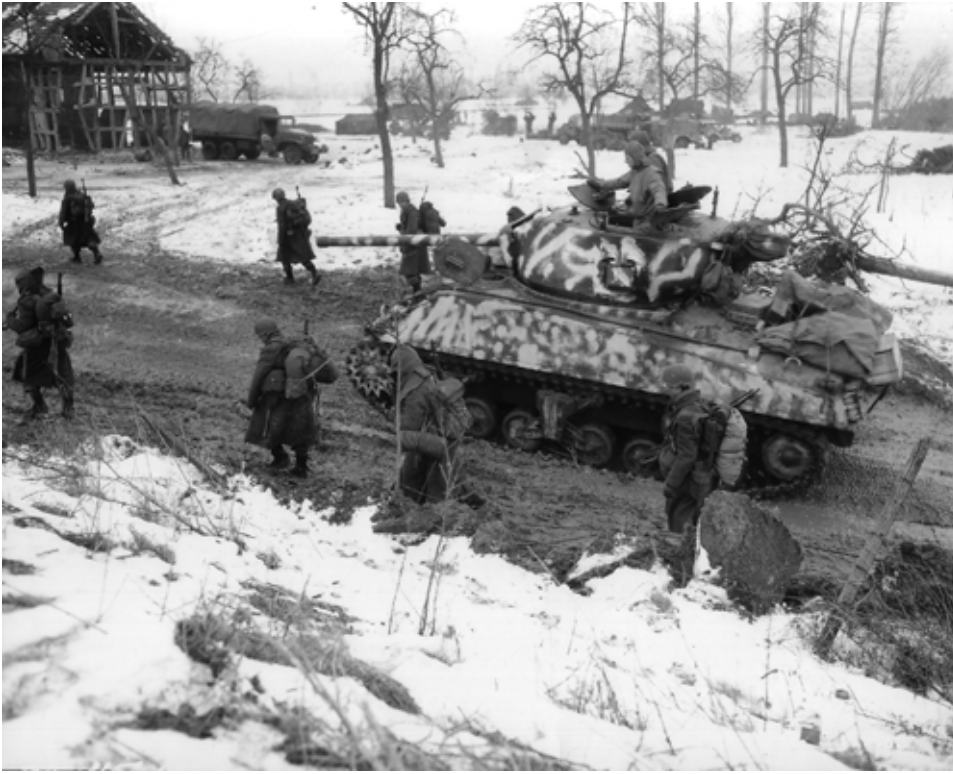
SC-199866: The 75th Infantry Division advances near Colmar on 31 January 1945.