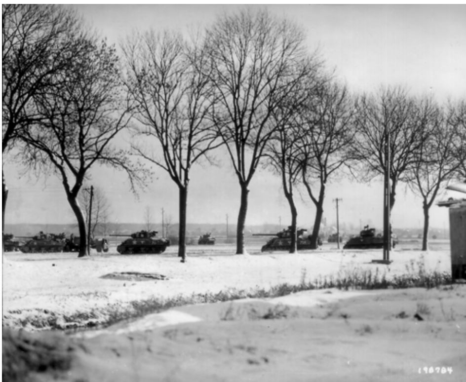
SC-198784: The 714th Tank Battalion, 12th Armored Division, readies for its fruitless counterattack on Herrlisheim on 8 January 1945.