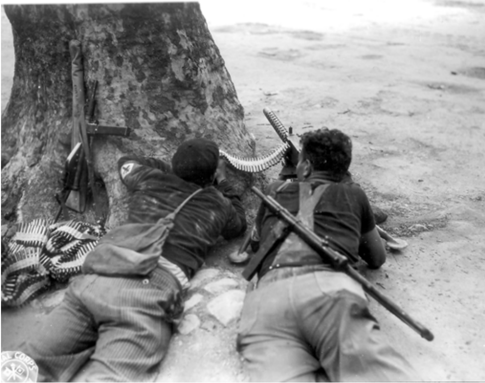
SC-193469: A Maquis machine-gun crew covers a road on 22 August 1944. The Resistance fighters were good at gathering intelligence, harassing German troops, and guarding supply lines, but they often did not take well to infantry life in the regular Army and performed poorly as infantry when supporting American forces.