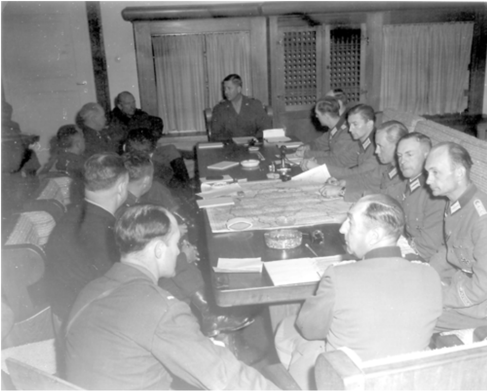
SC-208237: Lieutenant General Jacob Devers accepts the surrender of Army Group G from Generalfeldmarshall Albert Kesselring on 5 May 1945.