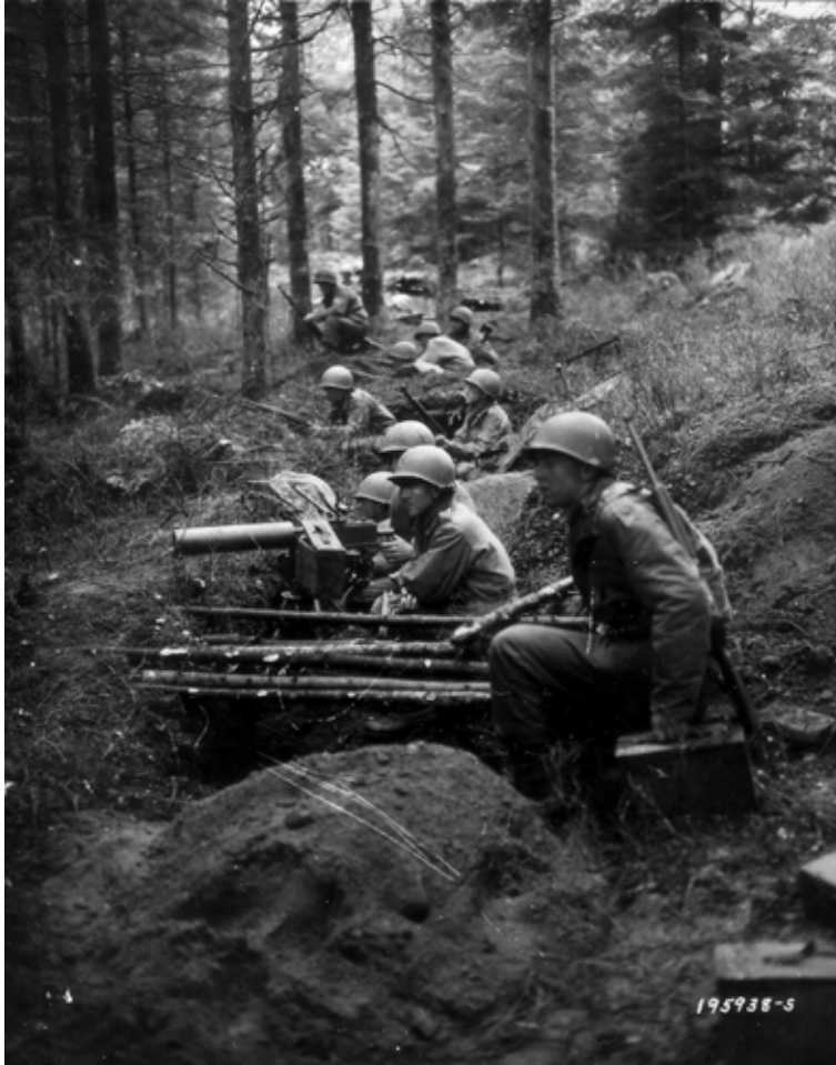
SC-195938: GIs from the 399th Infantry Regiment, 100th Infantry Division, man positions in a Vosges forest in early November 1944.