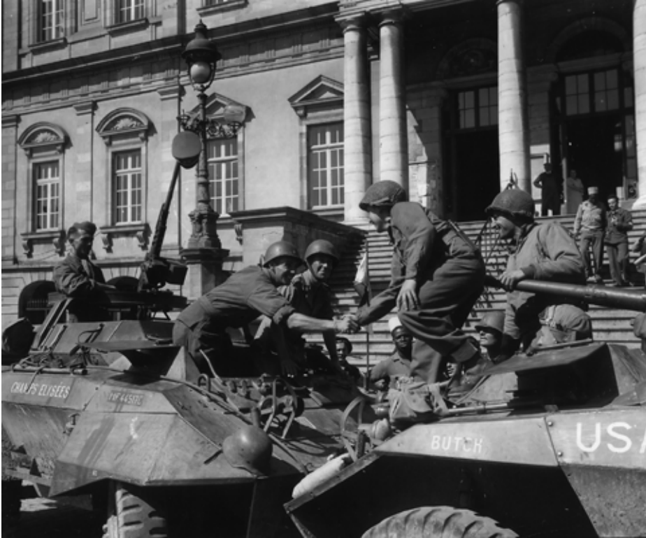
SC-193934-S: French First Army and U.S. Third Army troops link up at Autun, France, on 13 September 1944.