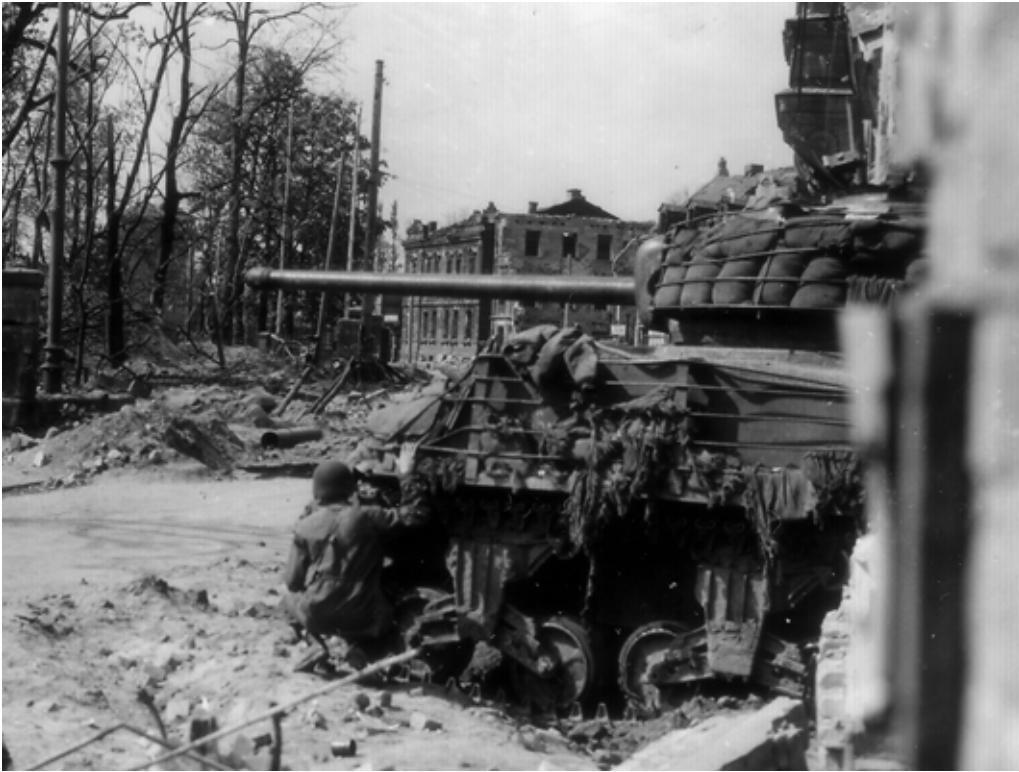
SC-203812: A 3d Infantry Division GI takes cover from sniper and machine-gun fire during fighting in Nürnberg on 19 April 1945.