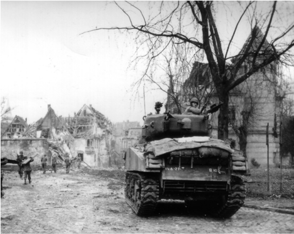
SC-198062: Combat Command A, 14th Armored Division, operates in Wissembourg, which lies on the Franco-German border, on 16 December 1944.