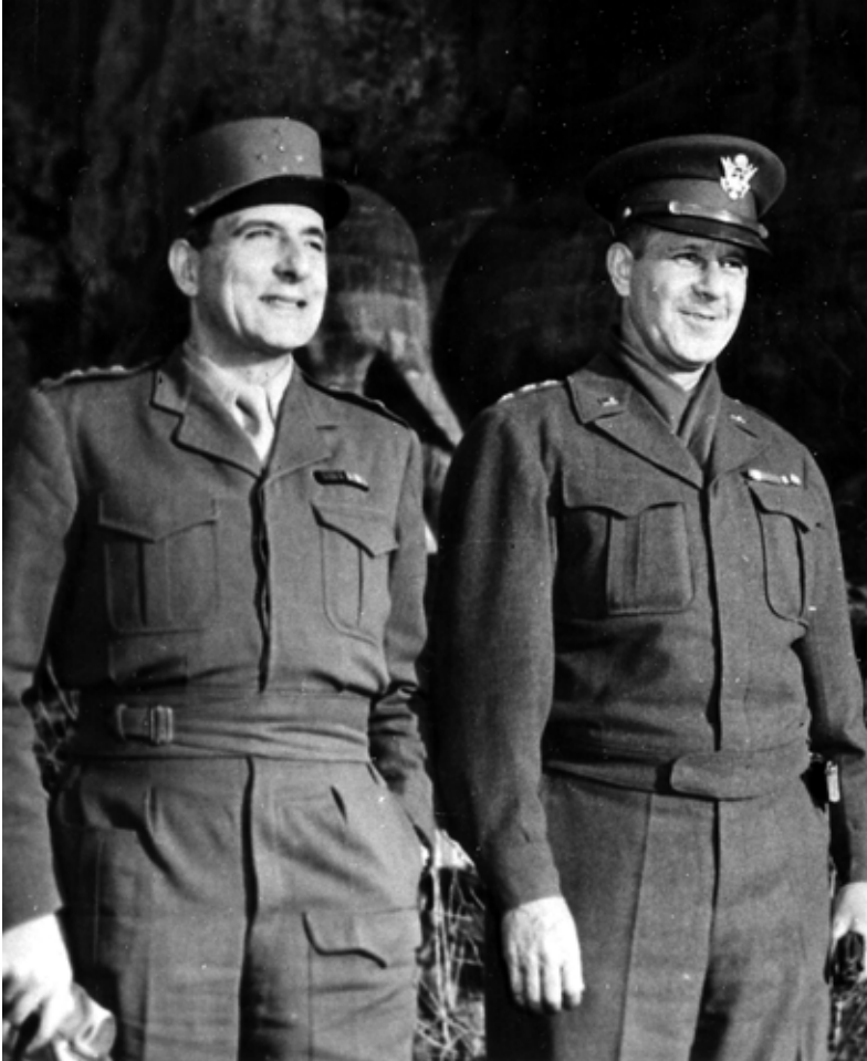
6thAG1_2: General Jean-Marie de Lattre de Tassigny (left) led the French First Army under the command of Lt. Gen. Jacob Devers (right), commanding general of the 6th Army Group.