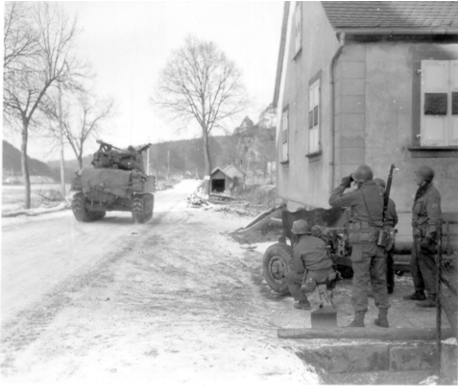
SC-198519: The 275th Infantry Regiment sets up to defend Phillipsbourg on 1 January 1945, only hours after the beginning of Operation Nordwind .