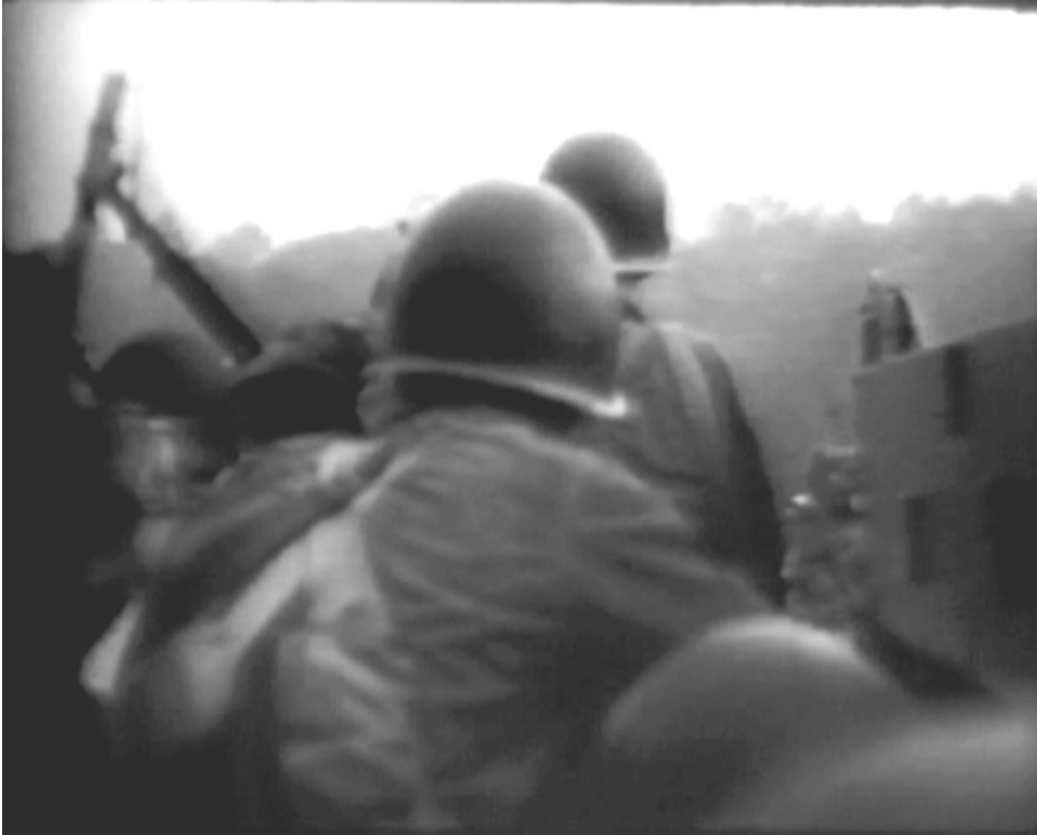
111-CB17_1: GIs from the 141st Infantry Regiment, 36th Infantry Division, exit their landing craft on the beach east of St. Raphael on 15 August 1944.