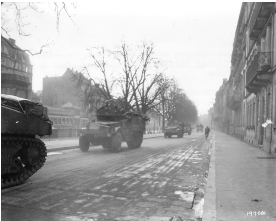
SC-197081: The French 2d DB enters Strasbourg on 25 November 1944.