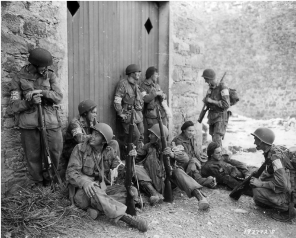
SC-192772-S: Americans from the 509th Parachute Infantry Battalion and British comrades from the 2d Independent Parachute Brigade, both part of the First Airborne Task Force, rest beside a farmhouse in southern France on 15 August 1944.