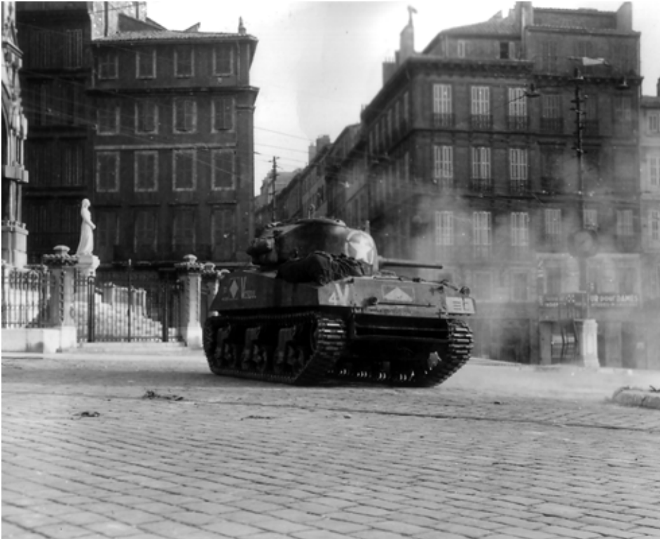
SC-193863: The Sherman tank "Vesoul" of the 4th Squadron 2d Cuirassiers fires during the fighting around Notre Dame de la Garde cathedral in central Marseille on 25 August 1944.