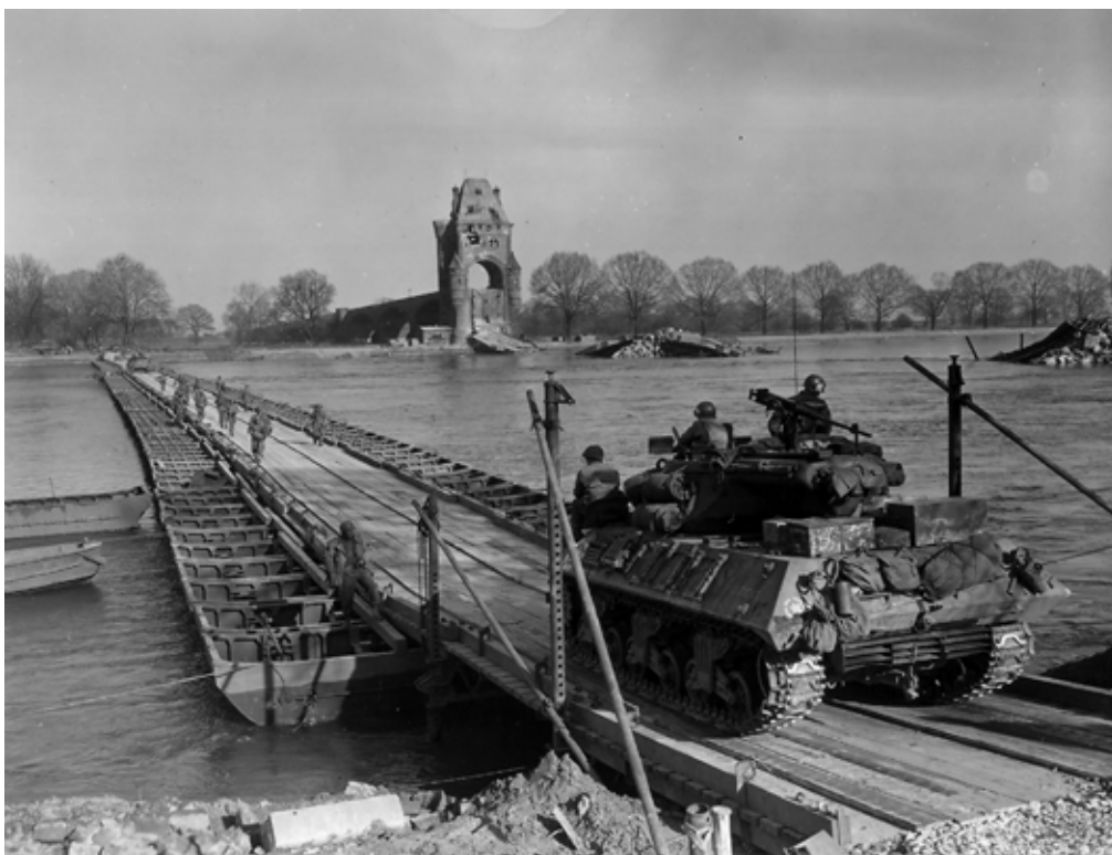
SC-208221: Seventh Army troops cross the Rhine River at Worms.