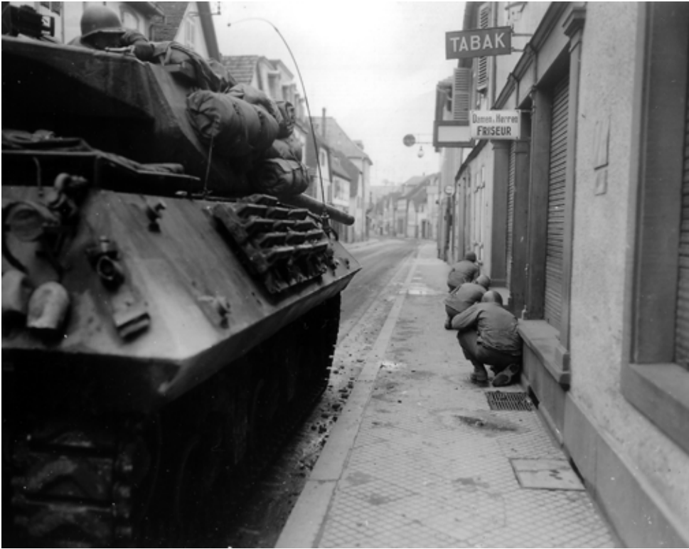
SC-197256-S: The 3d Battalion, 175th Infantry Regiment, works with an M10 during street fighting in Niederbronn on 10 December 1944.