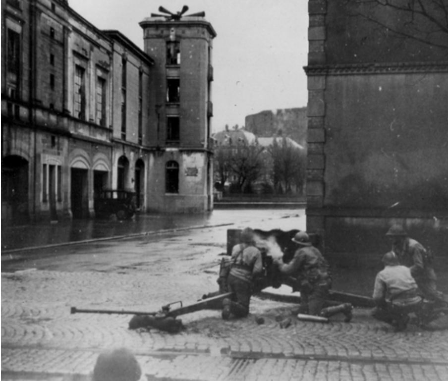
6thAG3: Commandos d'Afrique on 24 November 1944 fire a 57mm antitank gun to blast the Germans out of the Chateau du Belfort. (NARA, 6th Army Group records)