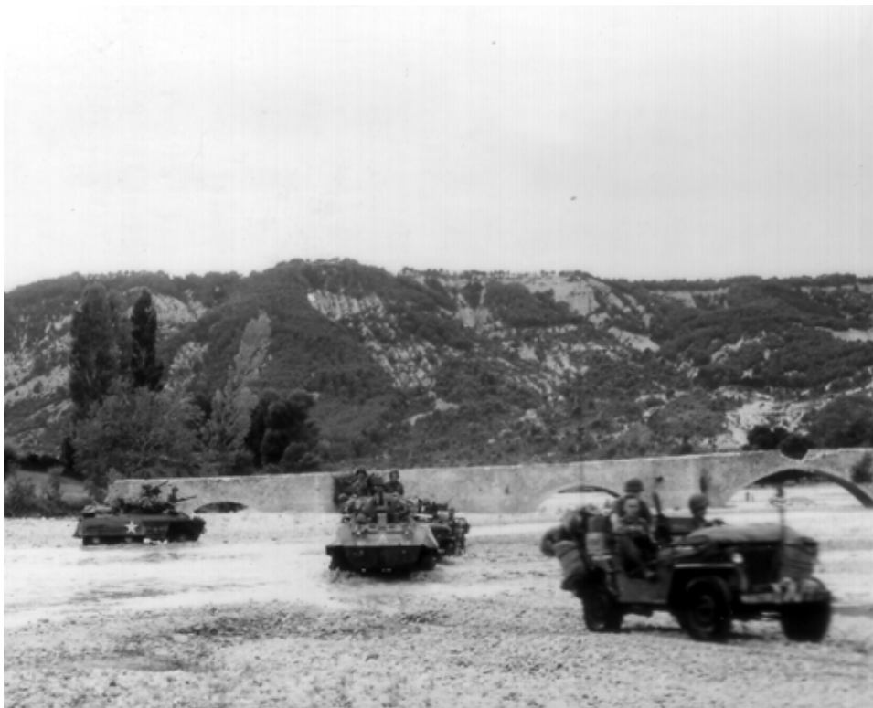
SC-193652: Butler Task Force's 117th Cavalry Reconnaissance Squadron advances near Riez on 18 August 1944.