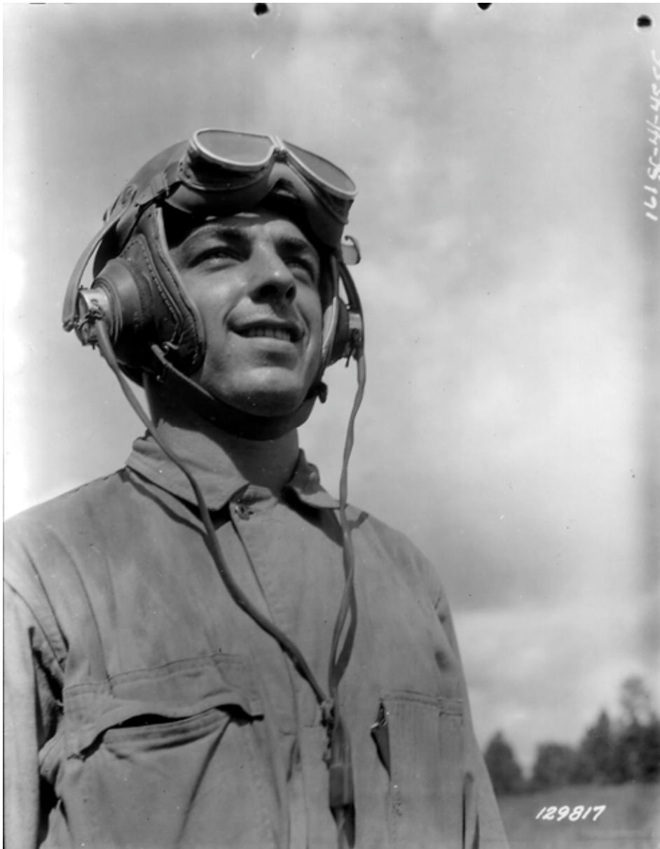
SC-129817: The leather tank helmet introduced in late 1941 had adjustable clamps to hold the earphones in place; a separate throat mike plugged into the intercom system. These coveralls have large pockets (not all did), a feature that annoyed some tankers because they snagged on protruding equipment in the tank.