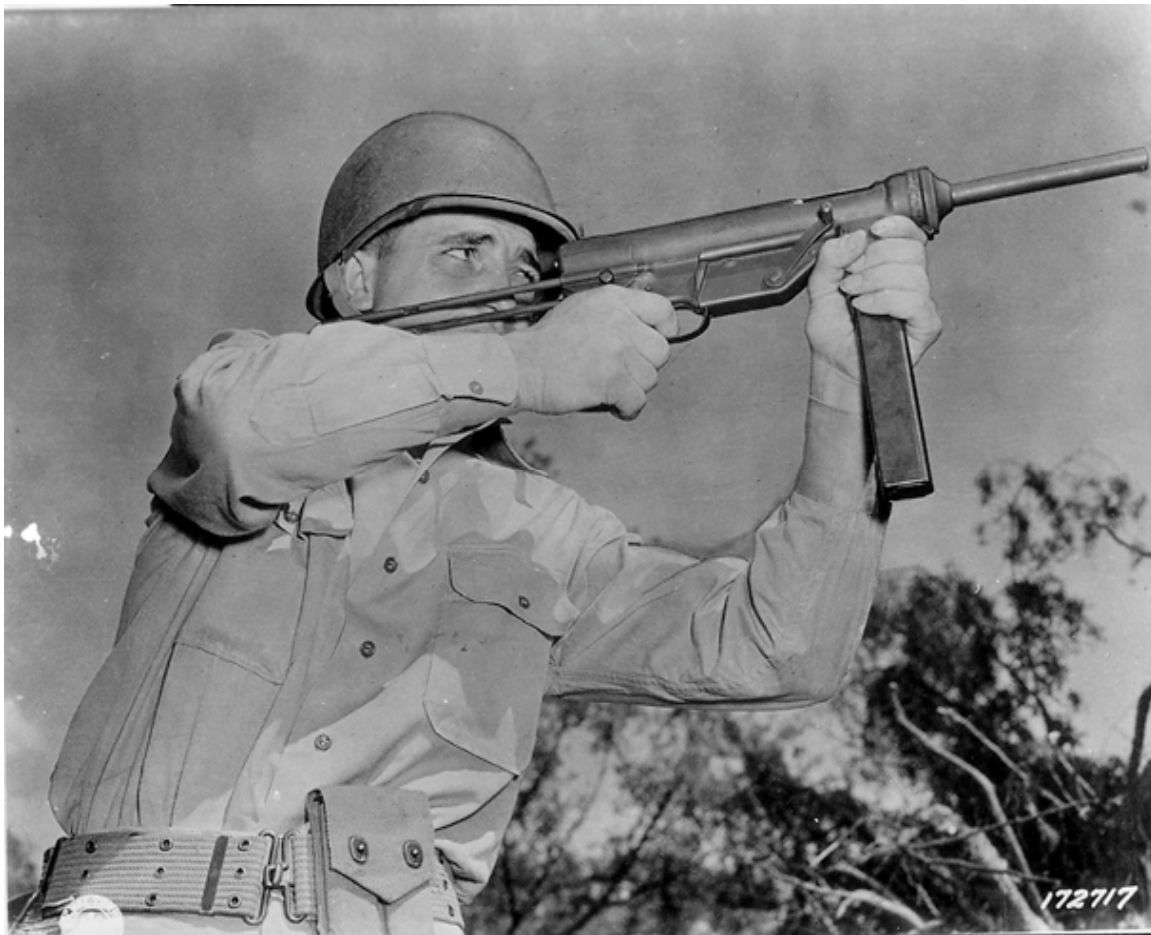
SC-172717: The M3 grease gun replaced the Tommy gun for tank crews late in the war.