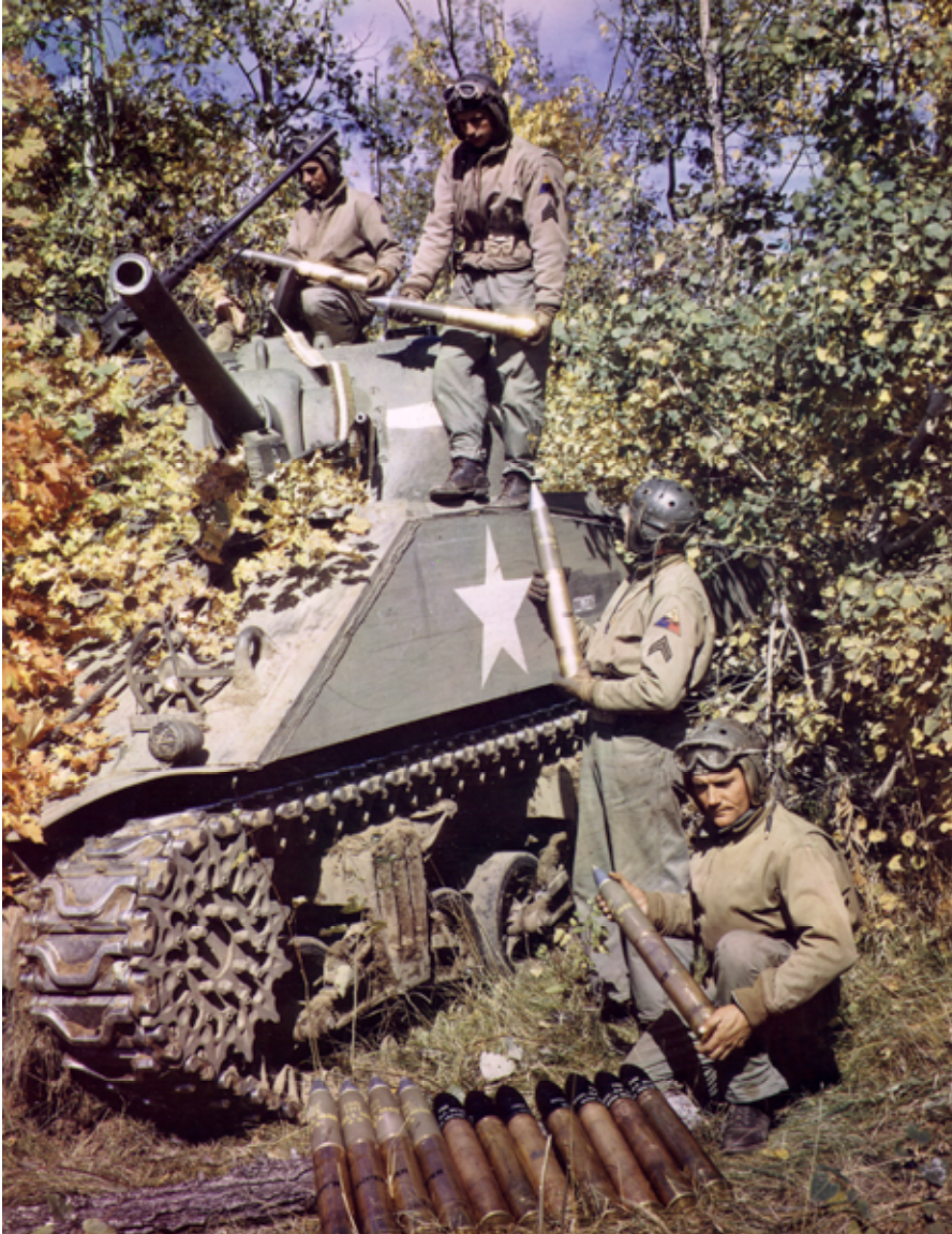
C-4633: A crew in olive drab coveralls and tanker jackets loads 75mm ammunition into an M4. The black-tipped shells are AP, and the silver-tipped ones are HE. [color photo]