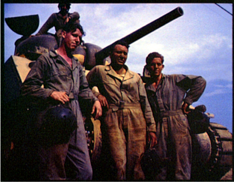
1a35215u: Tankers sport herringbone twill coveralls in blue and tan. (Library of Congress, Prints & Photographs Division, FSA-OWI Collection) [color photo]