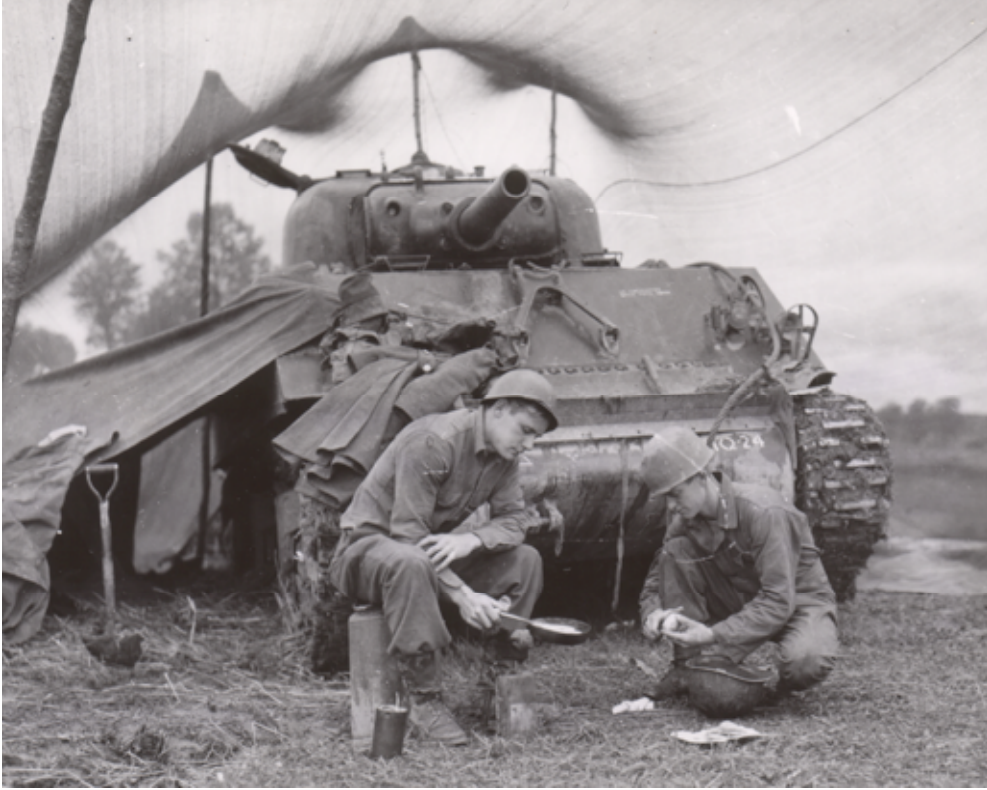
SC-195635: Tankers drove their home around with them. Often, sleeping quarters were no more than a shallow trench with the tank parked on top; tankers crawled in and out through the belly escape hatch. This assault gun crew from the 191st Tank Battalion is enjoying relatively luxurious digs.