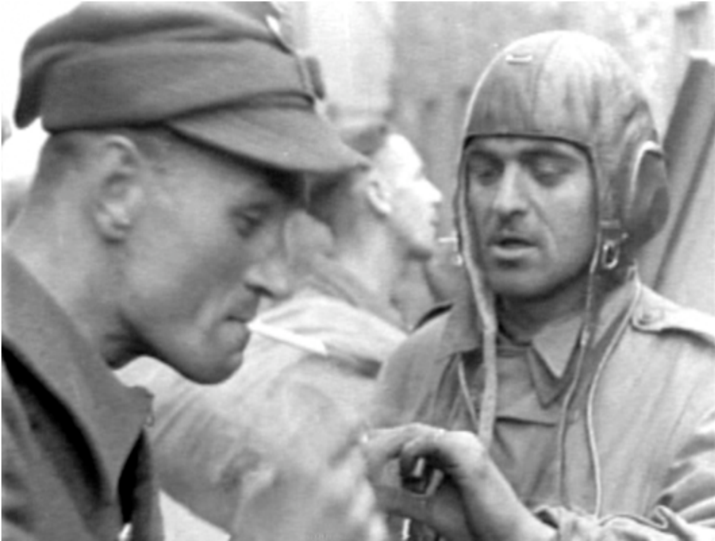
111-ADC-4025_7: This tanker is wearing the insulated winter helmet and has on an infantry field jacket for extra warmth. He is sharing a smoke with a just-liberated POW in April 1945.