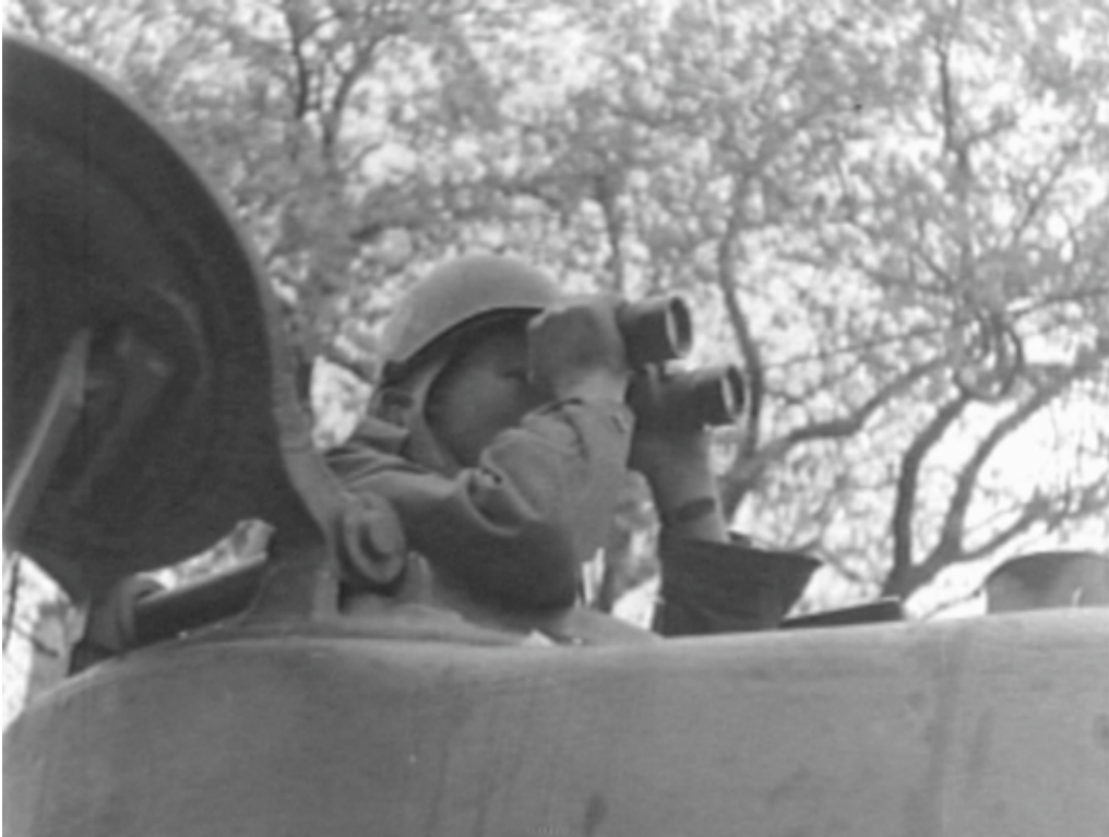
111-ADC-4025_6: Tankers preferred captured German binoculars to their Army-issued ones. (NARA, Signal Corps film)