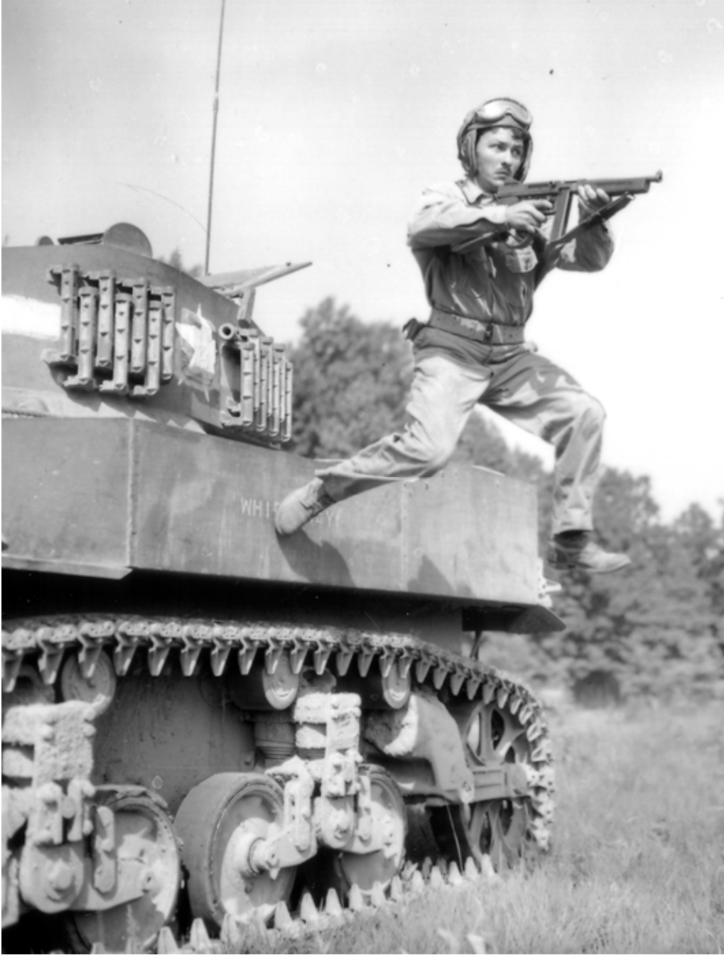
SC-185348: Crewman with a Tommy gun dismounts from his M5A1.