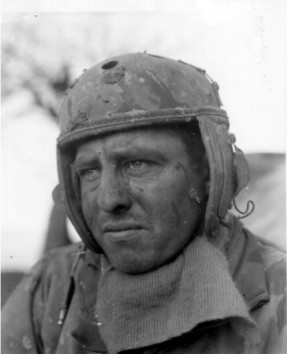
SC-197284-S: Begrimed from days of front line combat, a tanker arrives at a rest area behind the lines after his outfit is relieved in December 1944.