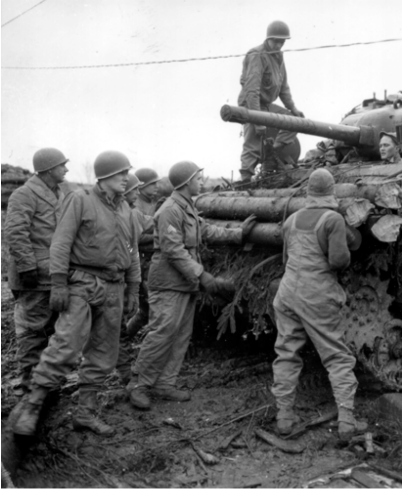
SC-337945: The soldier foremost to the left is wearing the tanker jacket, which was a prize target for liberation by other troops. The man foremost to the right is wearing the insulated bib-style overall.