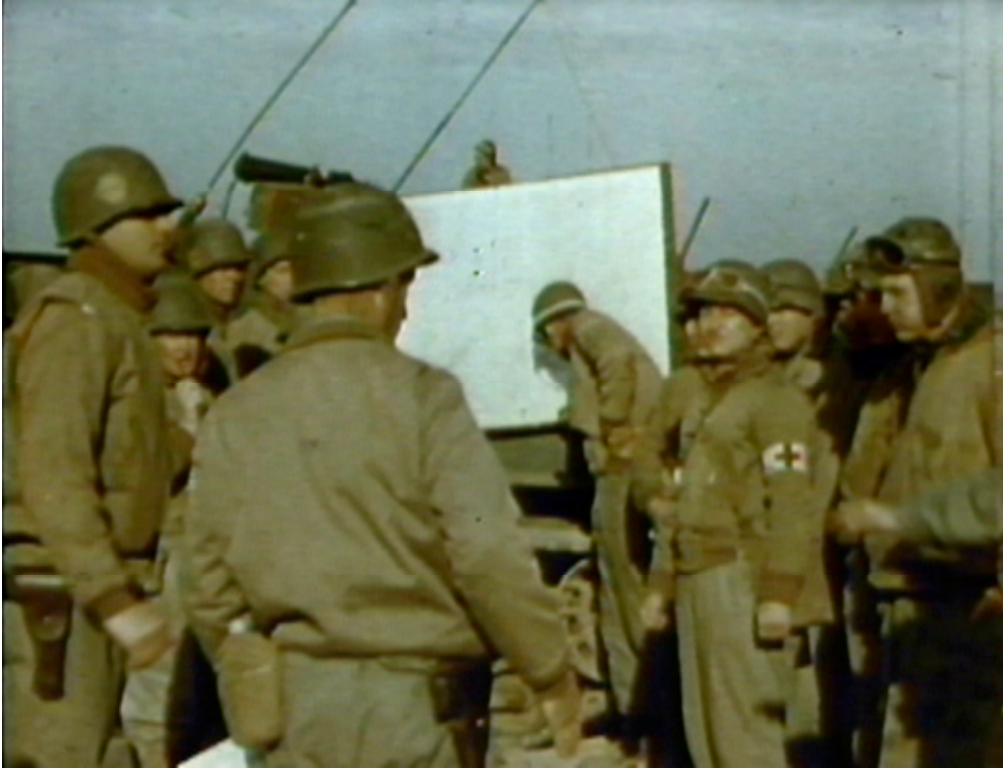
111-M-1001_2: Commander and staff, 2/13th Armored Regiment (left), brief probably company and detachment commanders on the day's plan in North Africa. A map rests against the side of the command halftrack. [color photo]