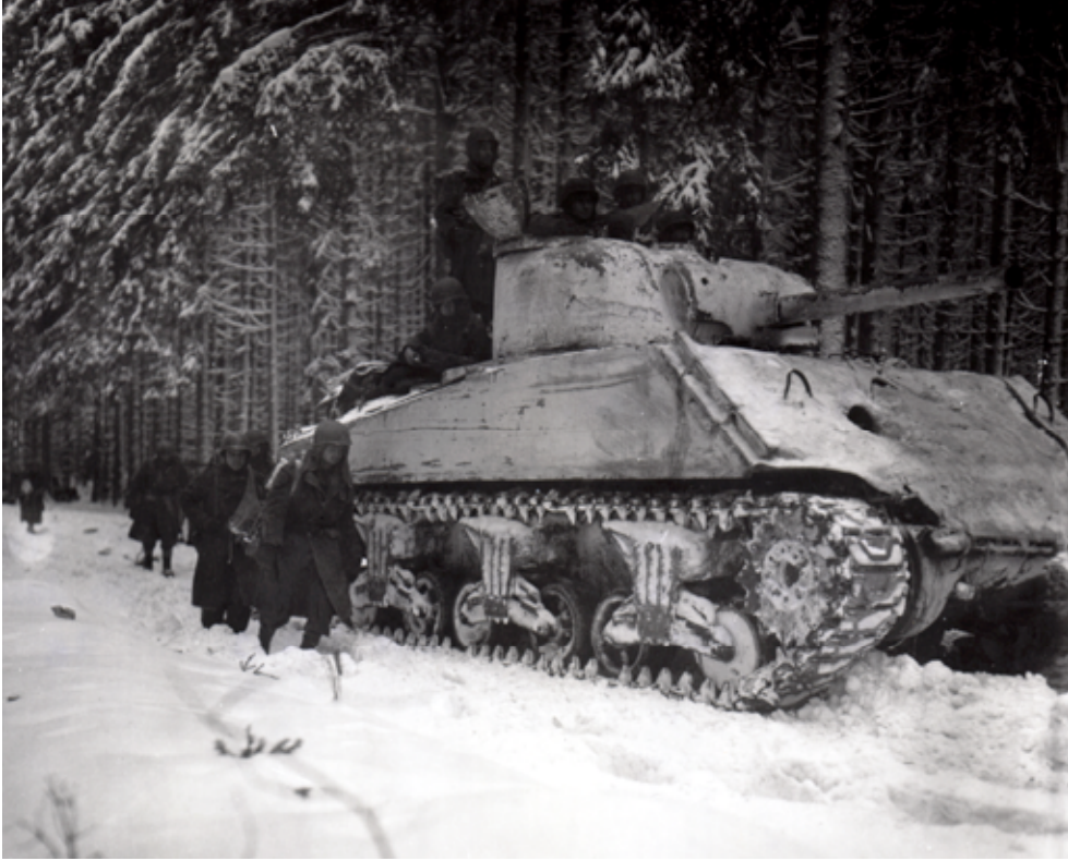
SC-337932: A camouflaged "armored Frigidaire" of the 750th Tank Battalion guards roads over which 75th Division infantrymen are advancing in the St. Vith area in January 1945. The cold kept fogging periscopes, so the tankers ran with their hatches open, and snow falling off the trees became so deep inside that the men could not reach the lower ammunition racks.